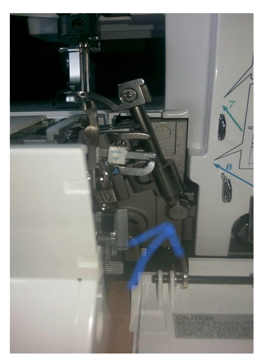
Sara Duarte This is what I adjusted to fix the issue