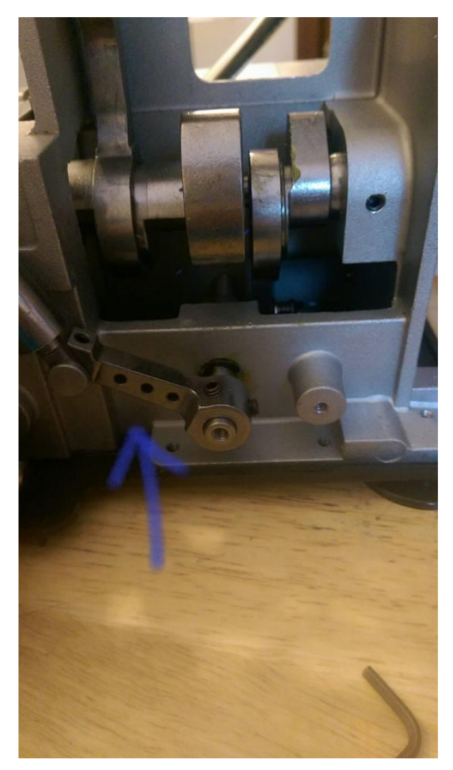
Sara Duarte This is the arm once the plastics are off