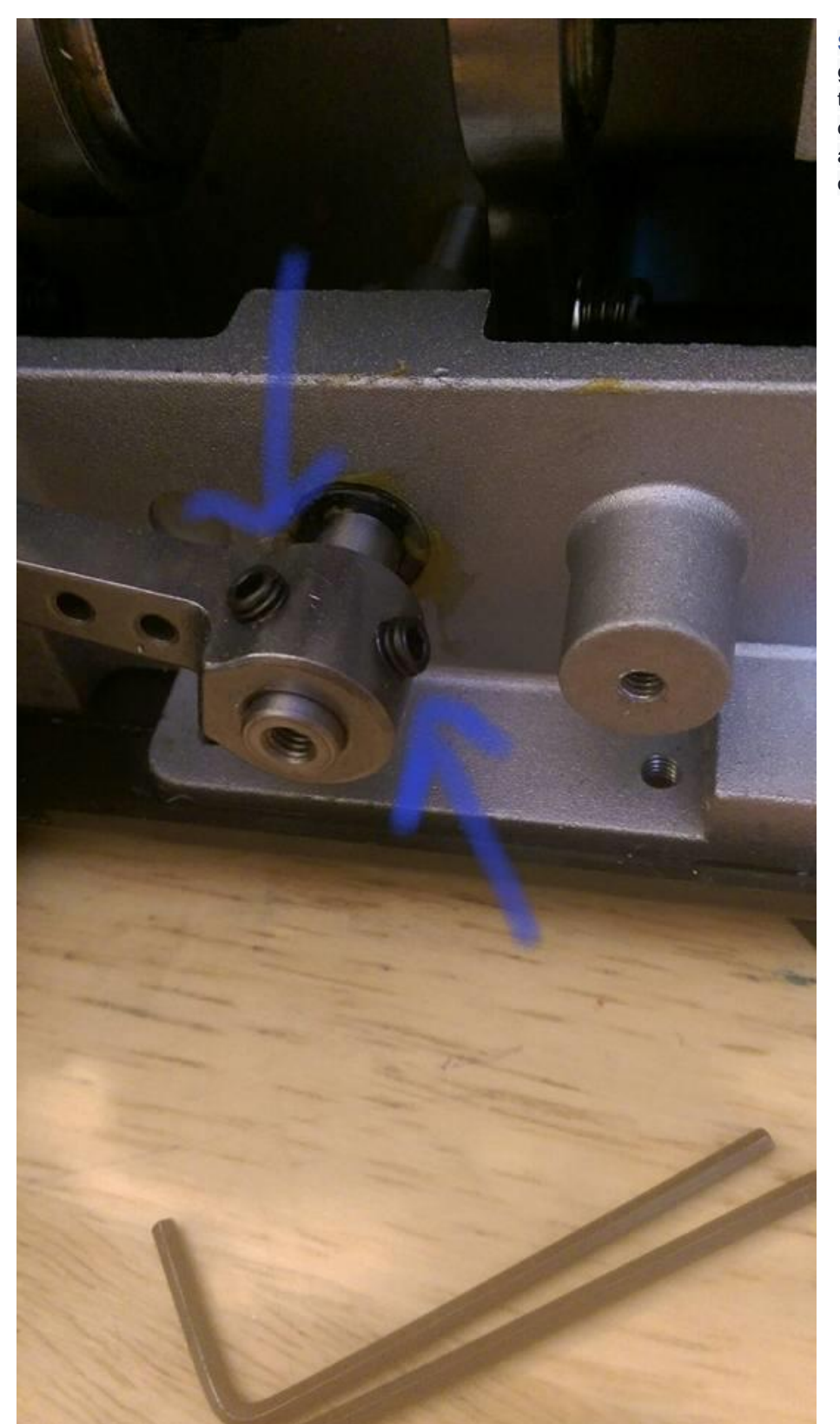
Sara Duarte Tighten those screws down & gently hand crank your machine... Watch the needles, upper looper & lower looper do a full cycle. Make sure nothing rubs at all. If it looks good out your plastics back on...